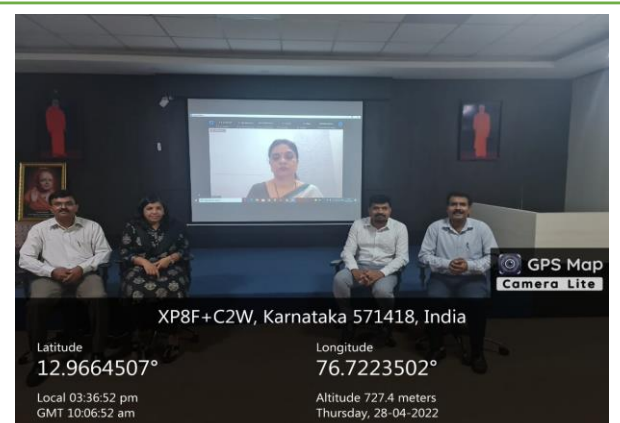
Group photo – Organizing team with speaker