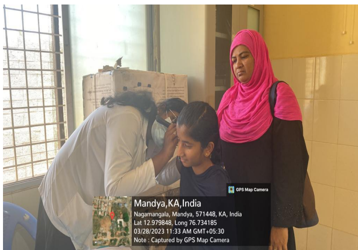
Screening done on residents of Bellur by ENT Postgraduates.