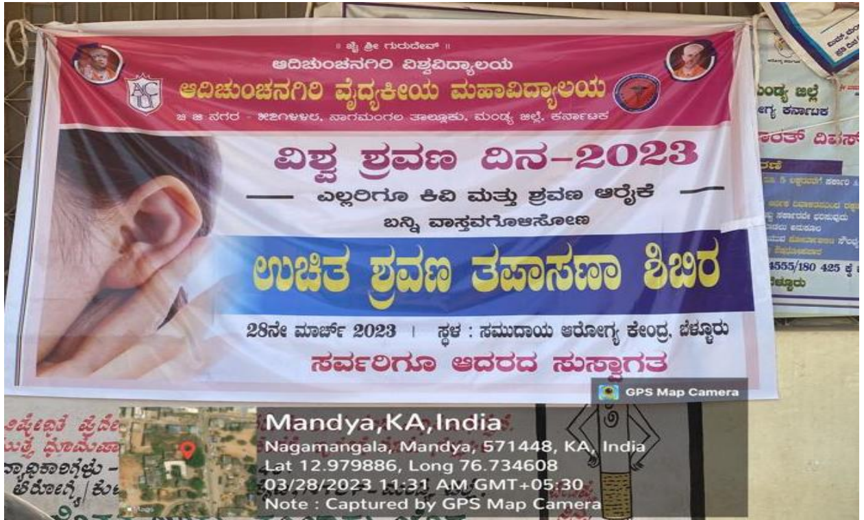
Poster for public awareness regarding the free hearing screening camp at CHC, Bellur.